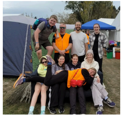
Easter Camp Team 2026