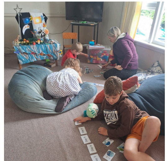
Kids Church Team think about God's World.

Make a note of the date now and plan to come along for a fun social evening with the whole parish. There will be an activity after dinner which all ages can participate in - not a Barn Dance but just as much fun for everyone!